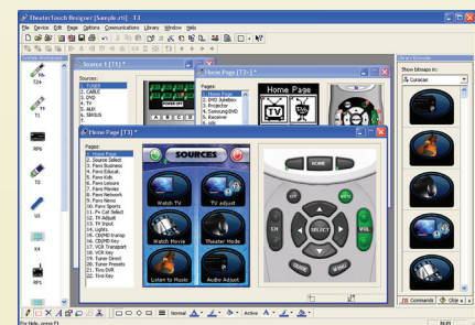
TheaterTouch Designer™ Programming Software