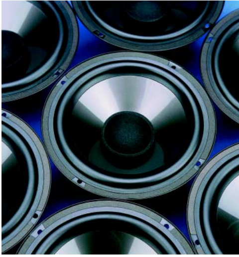
High performance CCMG cone drivers.