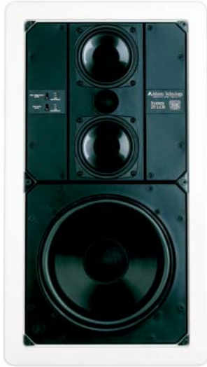
System 20 LCR