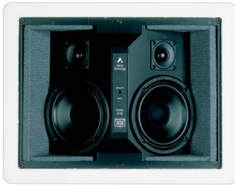
System 20 SR