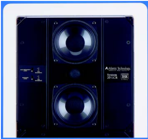
Rotating midrange/high frequency array

For more than a decade Atlantic Technology has specialized in creating high performance, high value home theater speaker systems. Our decision to build in-wall speakers wasn't taken lightly. Since we're unwilling to compromise our standards of performance and value, we knew we had to create in-wall systems that, in every regard, matched our existing enclosed speakers.