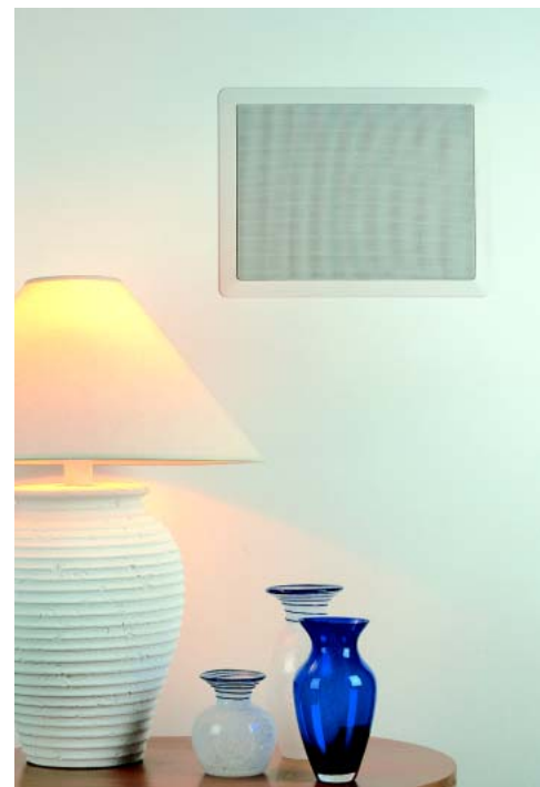
System 20 SR

System 20 THX brings a new level of musicality and accuracy to in-wall speakers, following in the footsteps of its sibling, the highly regarded System 370 THX. It's now possible to install a nearly invisible music and home theater system that competes head to head with the highest quality traditional speakers. We're proud to have developed and introduced this advanced speaker system. It quite simply sets a new standard of performance for in-wall speakers.