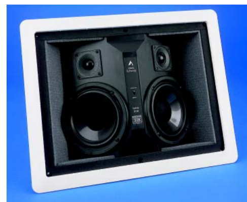
The System 20 SR is the first true Dipole speaker that mounts in a standard 2 x 4 studded wall.