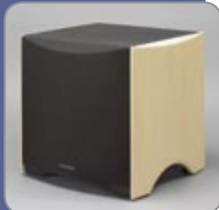
212 SB in Maple