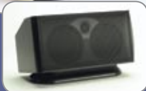
Optional 1200 C shown in satin black (above)