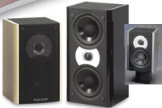
2200 System shown in gloss black (below)