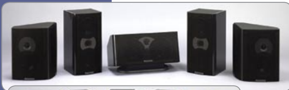
1200 System shown in maple (above)