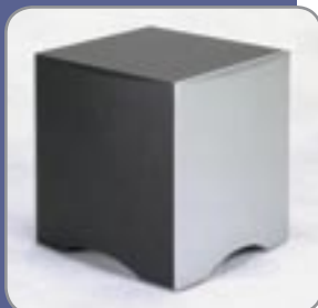
102 SB in Silver