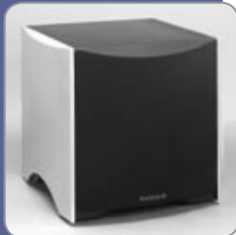
422 SB in Silver