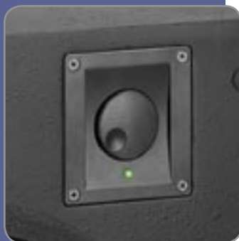
642e SB's Front Panel Level Control