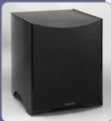
Optional 642e SB Subwoofer shown in Gloss Black

We sincerely believe that within its price range—or even well above—it is one of the finest speaker systems available. Once you see and hear it for yourself, we are confident you will agree.