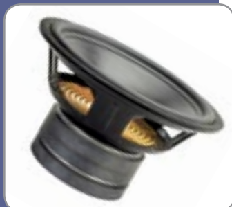
642e SB's Powerhouse 12" Driver